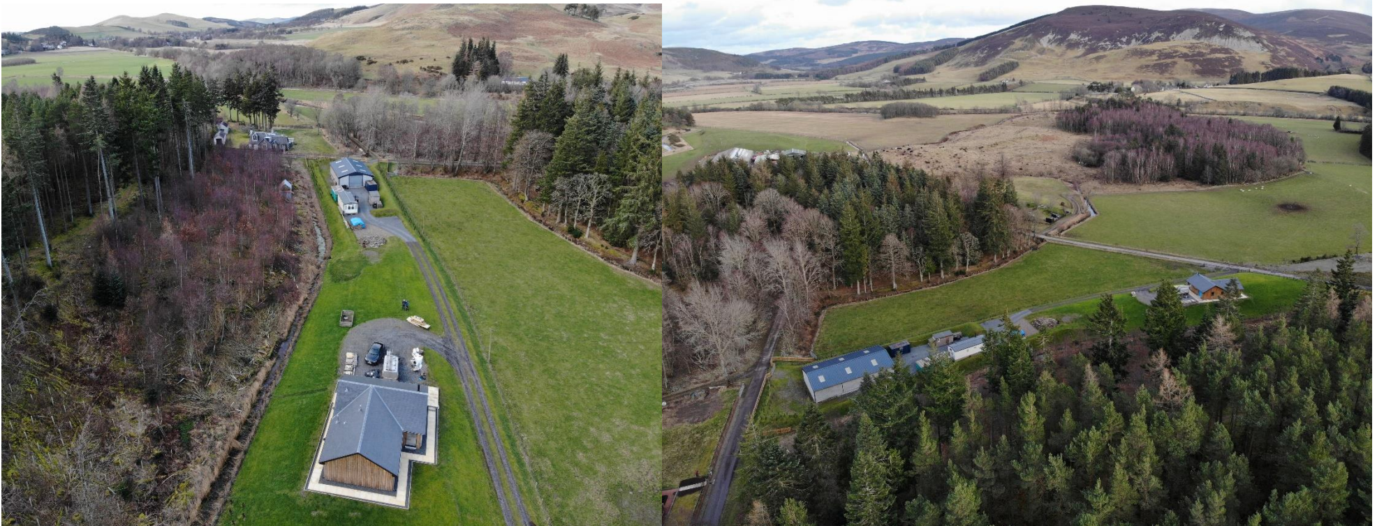
Fig 4: Aerial photographs of the proposal site within the setting of the Rachan dispersed building group.