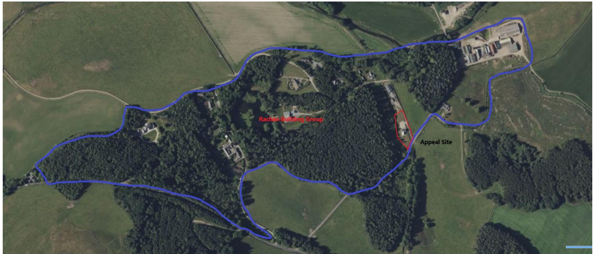
Fig 2: Aerial View of Rachan within natural boundary (in blue) established by woodland.